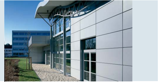
Customer training centre, Lüdenscheid

After the reception building, the 1,380 m 2 training centre, fitted with highly modern media and conference technology, is a further architectural high point in the 114,000 m 2 company grounds. "The purpose of this new building is to send a signal to the market. It forms part of a vision which focuses on the customer and guides our employees. Skilled craftsmen need modern industry and modern industry needs skilled craftsmen". (Heinz-Peter Paffenholz, Chairman)