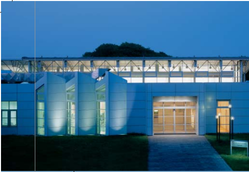
Customer training centre, Lüdenscheid