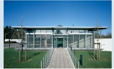
Reception building, Lüdenscheid

Busch-Jaeger is the market leader with over 100 years of history in the field of electrical installation technology. We have manufacturing plants at two sites in Germany and five in other countries.